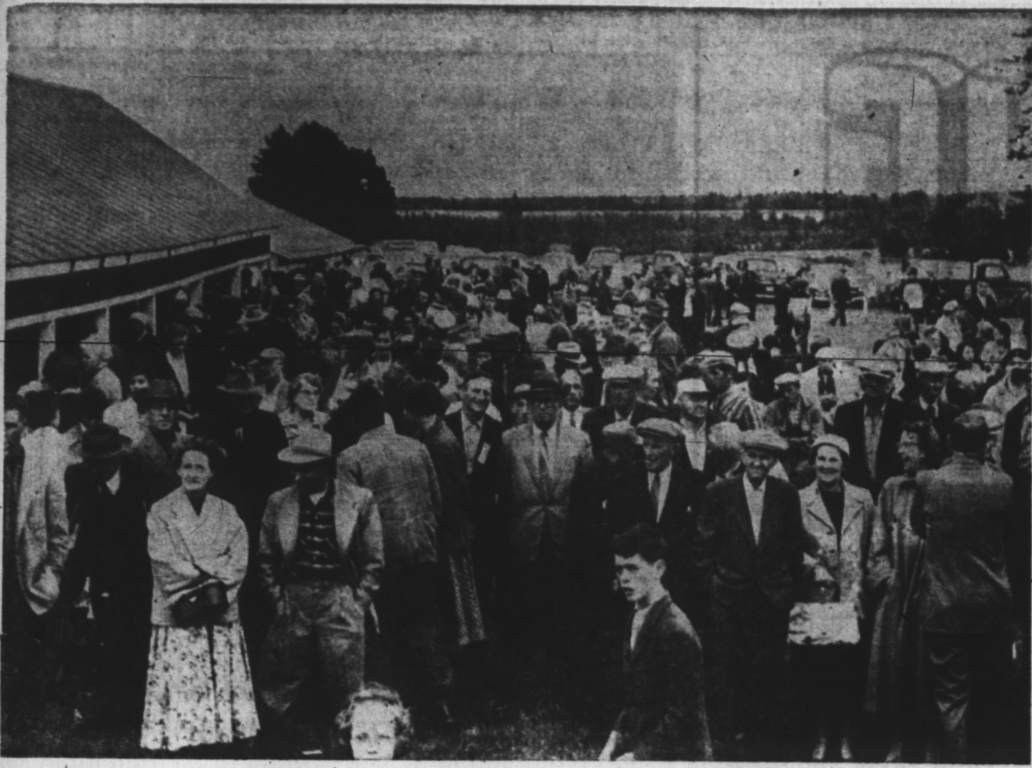
CONTESTANTS AND EXHIBITORS ATTRACT A CROWD