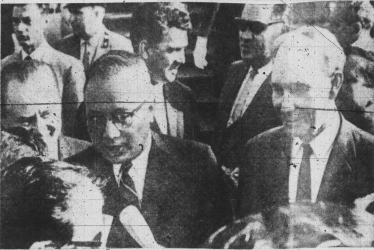
MISSION TO MOSCOW

THE RICH GET POORER HYDERABAD, India (AP)—His Exalted Highness the Nizam of Hyderabad, once reckoned as the world's richest man and still immensely wealthy, owes about $30,000 in long-overdue electricity bills, says the Andhra Pradesh state government. Legislators want to deduct the amount from the privy purse he gets from the Indian government for lands seized from his former realm.