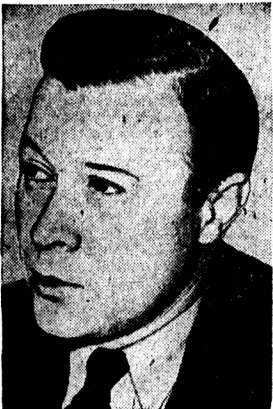
WALTER REUTHER U.A.W. President

The first union-negotiated pension plan in Canada will go before Ford Motor Co. employees at Windsor, Ont., for approval. It provides for $35 a month payable at age 65 after 25 years' service. The company offer follows a joint company-employee conference with Hon. Paul Martin, federal minister of health and welfare, in which the minister indicated his belief there will be a national old age pension of $40 a month at age 70 with no means test within two years. This means that eventually a Ford worker will receive a pension of $95 a month at 70. Ford executives also revealed a new bonus plan for production workers, with bonuses to be based on total profits of the company. Walter Reuther, U.A.W. president, sat in at last-ditch negotiations in Windsor to avert a Ford strike. The assembly line was closed down to give employees a chance to attend a mass meeting at which the company's offer will be presented.