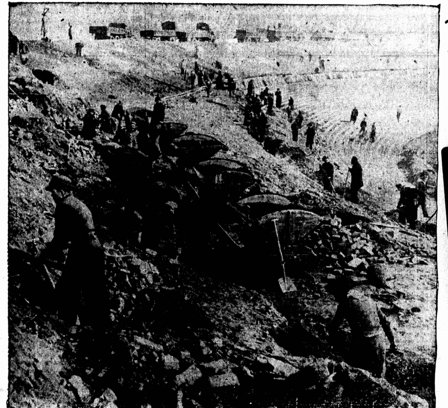
BERLIN REDS GET READY FOR 'MAYTIME' — Members of Berlin's Frei Deutsche Jugend, Communist youth organization, work on a stadium slated to seat 70,000 persons for a giant May parade and demonstration in the Soviet sector of the German capital. Hundreds of members of the Soviet youth group have been brought to Berlin to help get ready for the May demonstrations, during which Reds have threatened to "take over" Berlin's western sectors.