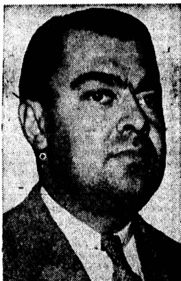
PAUL MARTIN Minister of Health

The first union-negotiated pension plan in Canada will go before Ford Motor Co. employees at Windsor, Ont., for approval. It provides for $35 a month payable at age 65 after 25 years' service. The company offer follows a joint company-employee conference with Hon. Paul Martin, federal minister of health and welfare, in which the minister indicated his belief there will be a national old age pension of $40 a month at age 70 with no means test within two years. This means that eventually a Ford worker will receive a pension of $95 a month at 70. Ford executives also revealed a new bonus plan for production workers, with bonuses to be based on total profits of the company. Walter Reuther, U.A.W. president, sat in at last-ditch negotiations in Windsor to avert a Ford strike. The assembly line was closed down to give employees a chance to attend a mass meeting at which the company's offer will be presented.