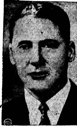
GOP ADVISER — Former Sen. John Sherman Cooper, Kentucky Republican, was named by Secretary of State Dean Acheson as his adviser at the forthcoming Big Three Foreign Ministers Conference in London.