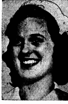
Blonde school girl, Miss Winnipeg, is crowned before a crowd of 4,300 attending fifth annual jamboree staged by Greater Winnipeg's Associated Community clubs.