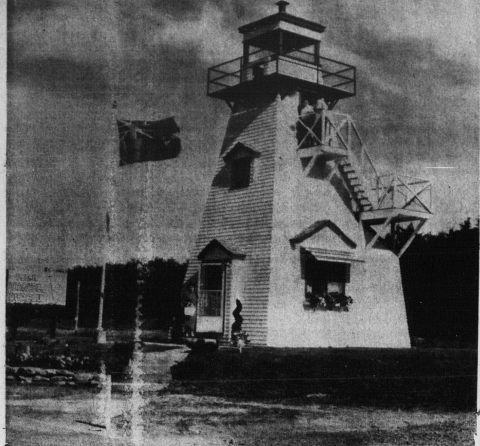
ALBANY BUREAU HELPED RECORD TOURIST FLOW