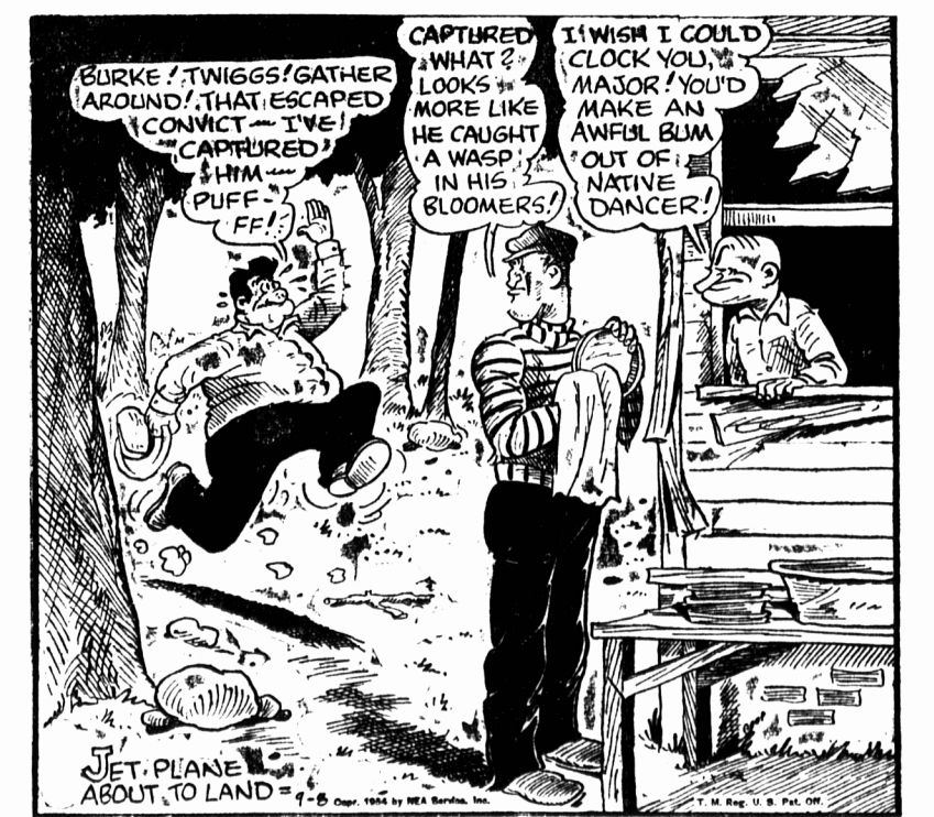
Out Our Way