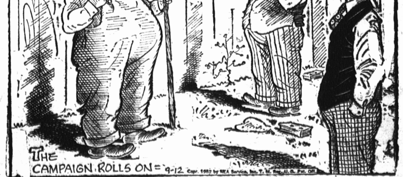
EGAD, BOYS! THIS HOMESPUN PHOTO OF ME MAY WELL TURN THE TIDE IN MY RACE FOR PRESIDENT! THE WORLD LOVES A PLAIN, DOWN-TO-EARTH, GRASS-ROOTS MAN—HARRUMPH!