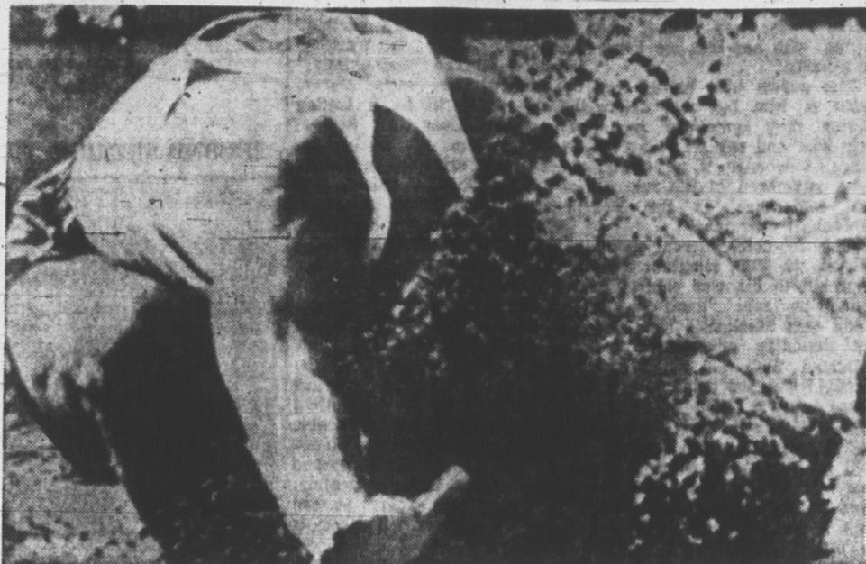
WINNING, OSTRICH STYLE