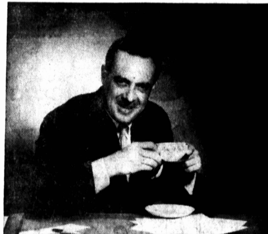
BUSY MAN ENJOYS TEA BREAK—Here's a man who has found a cup of Tea works wonders when the pressure mounts.

"The gifted child must learn to tolerate fools gladly," he said. "But he must never be taught the easy road of conformity."