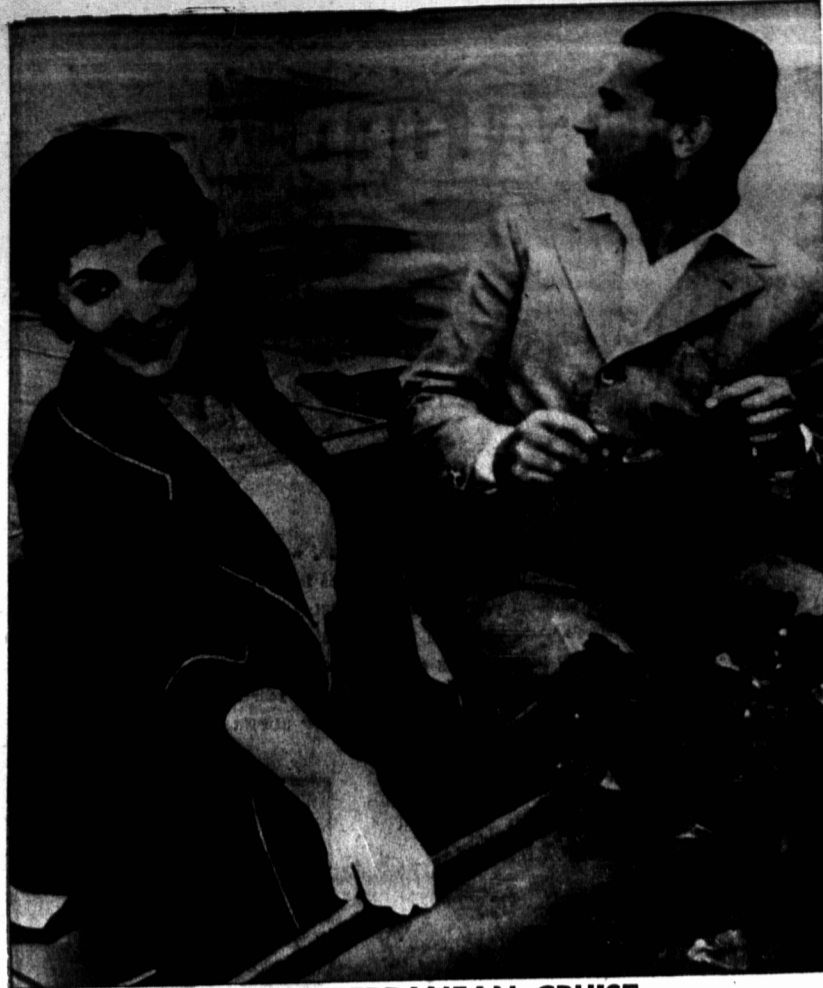
OFF ON MEDITERRANEAN CRUISE