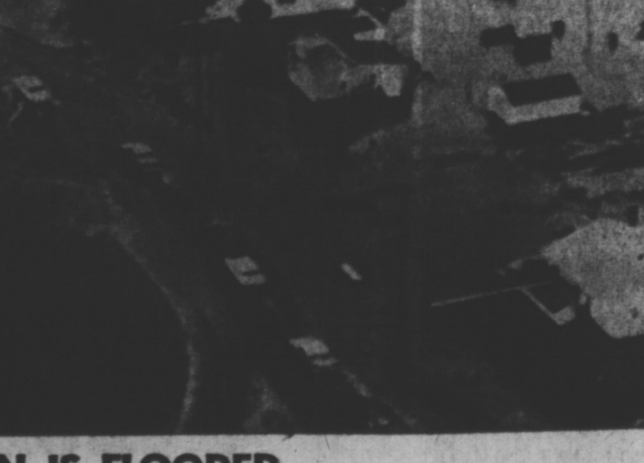
MANITOBA TOWN IS FLOODED

The Territories reported nine polio cases. There were eight in Quebec, three in Ontario, one in Manitoba and two in Alberta.