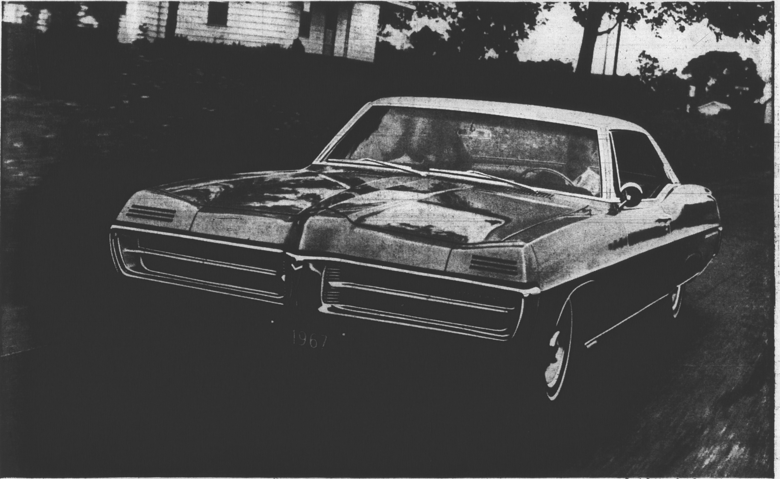
Grande Parisienne Sport Coupe with optional vinyl top

Introducing the adventurous new Pontiacs for 1967! Here's today's brand of action...for today's kind of people.