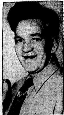
GUEST REFUSED OYSTER HOST ATE IT INSTEAD AND FOUND A PEARL

LIFELINE TERMINUS — This airport in South Korea is currently one of the world's busiest. UN planes arrive or depart at one-minute intervals, bringing in men and supplies for the Korean War. Here planes and supplies line a runway.