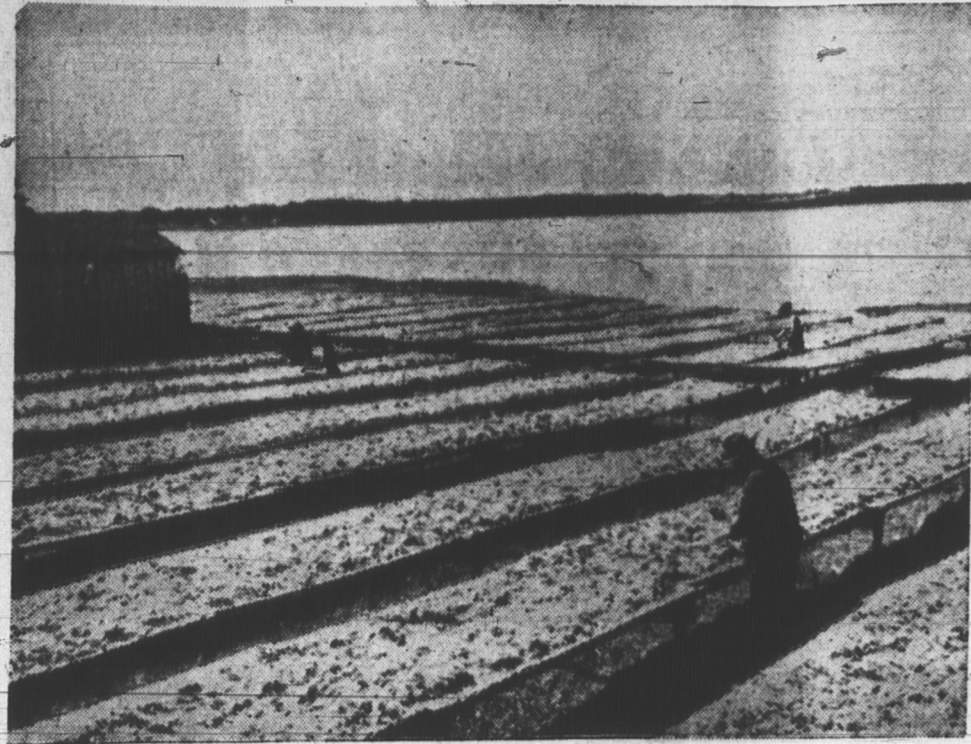
IRISH MOSS SPREAD TO DRY