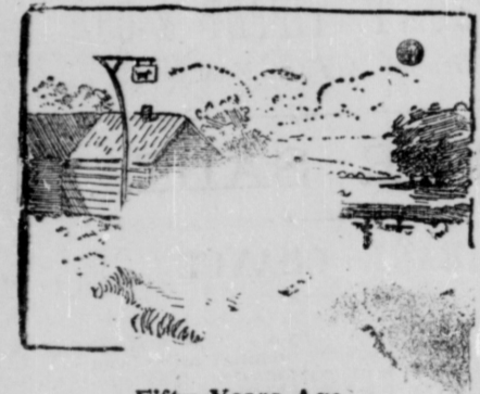
Fifty Years Ago.