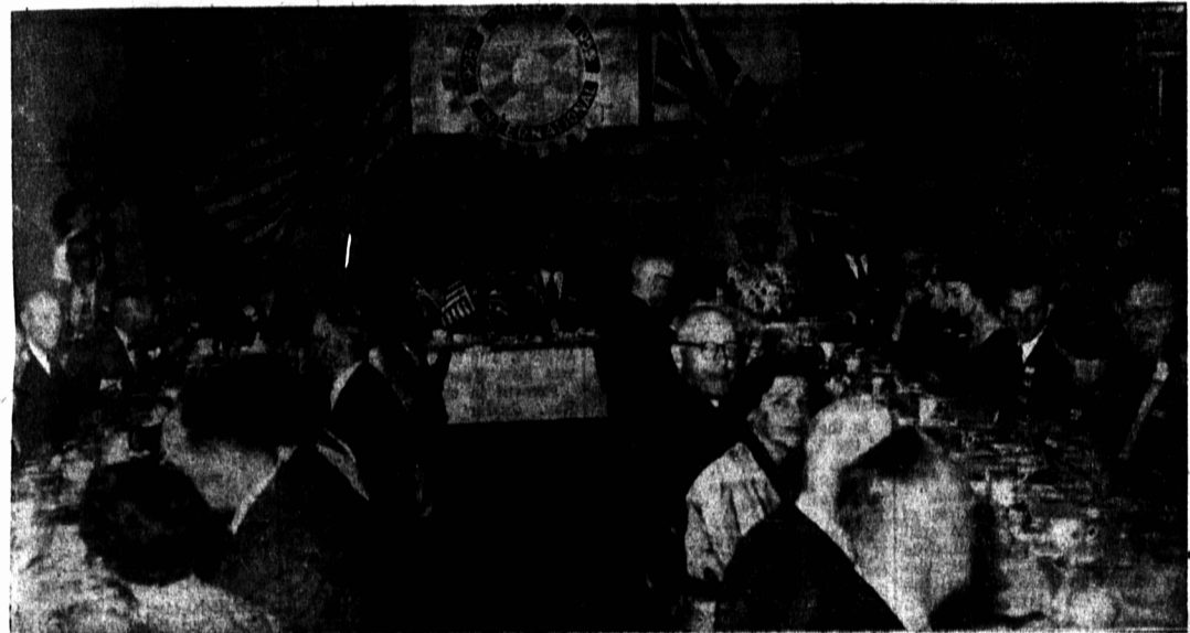
An overflow attendance at the Rotary District Conference banquet at the Charlottetown Hotel last night required the opening of a second dining room with public address system to reach the guests in dining room "B".