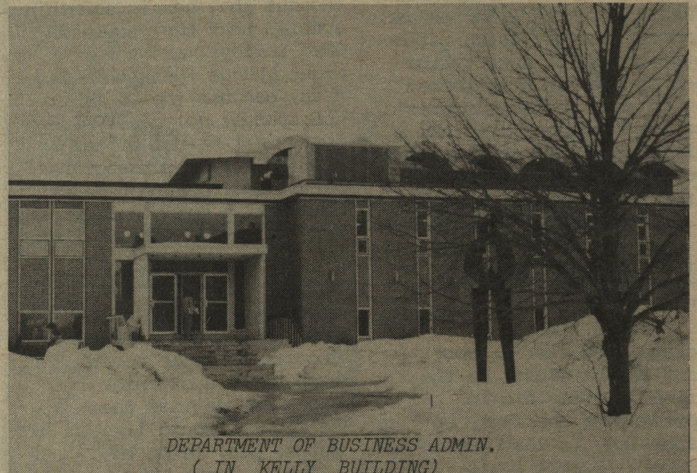
DEPARTMENT OF BUSINESS ADMIN. ( IN KELLY BUILDING)

The Society had three very successful parties during this period. Each member of the Society is supposed to pay $3.00 as registration fees. Well, a simple mathematics will show that this sum of money at their disposal is relatively very small for them to organize such parties. But they did organize them successfully well. At this point I once again thank all the faculty members of the department for making time available to attend all these parties. But for those parties, I would not have known most faculty members of the department, whose present advice is indispensable