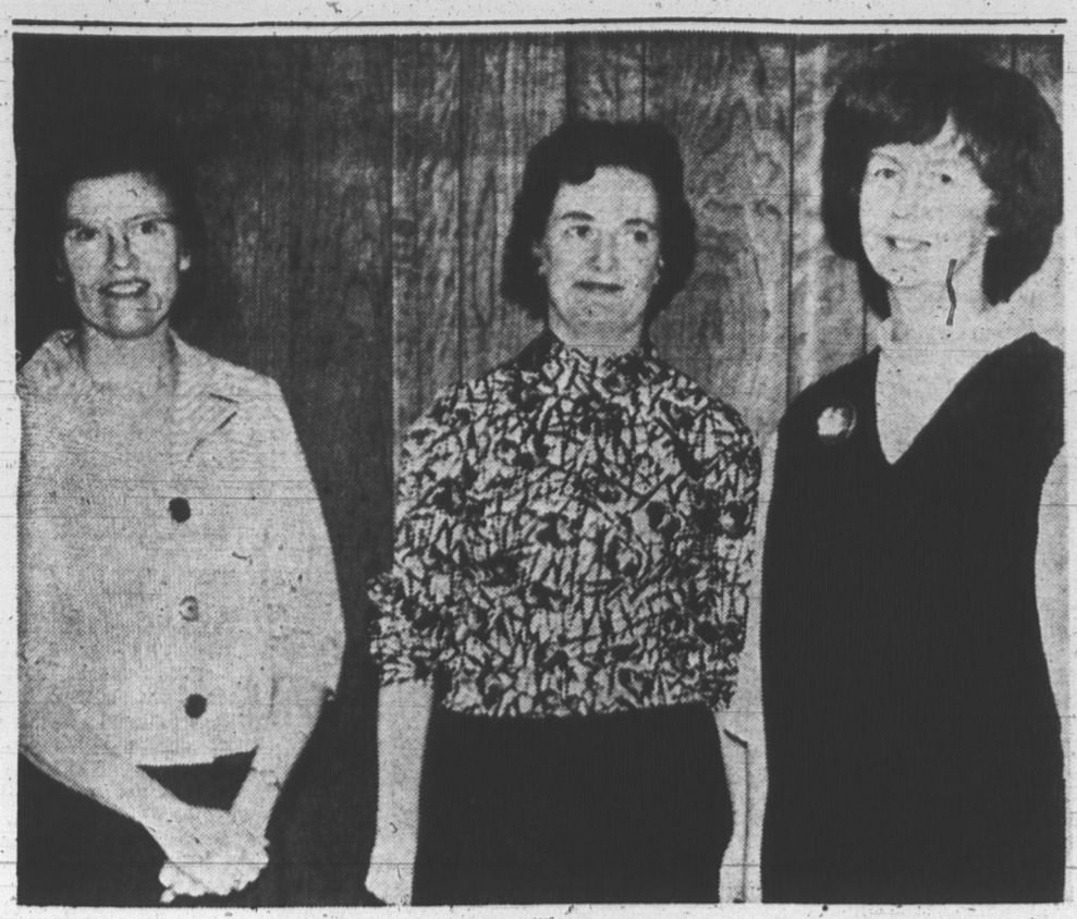
FINAL MEETING FOR YEAR