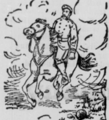
A SINGLE RIDER WAS SEEN GALLOPING FURIOUSLY.

HEREVER the English language is spoken, the after war romances of the great Civil War of the United States are read with avidity. None which have so far appeared have more human interest than the latest from the pen of Bret Harte. Its title, which appears at the head of this column, is the name of the heroine, and the story is charmingly written in the great novelist's best vein. The characters are all