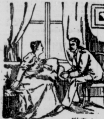
COURTLAND LOOKED UP RECOVERING HIS USUAL CALM.

Watch for the first installment of this great story; it will well repay a perusal. And tell your neighbor, if he