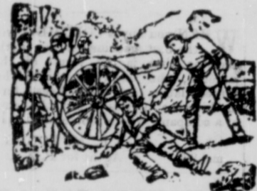
THE HANDSOME ARTILLERY OFFICER DISMOUNTED AND WAS GENTLY REASSURING THE DEAD MAN.

The story is appropriately illustrated, a few sample illustrations being given herewith.