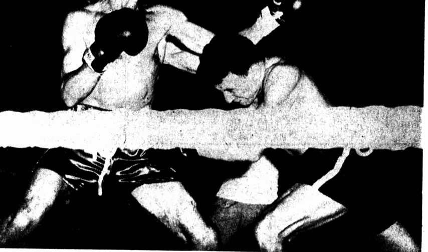
With both fighters boring in to the attack, one of the navy boxers side-steps a hard right to the face and counters with a right jab to the head at the boxing and wrestling program at R.C.A.F. Station Summerside on Saturday night.