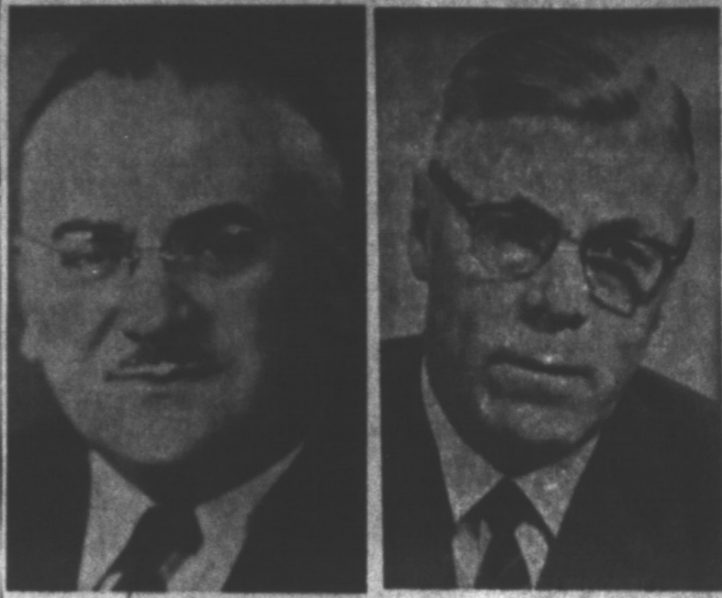
W. R. JENKINS

This new healing substance is offered in suppository or ointment form called Preparation H. Ask for individually sealed convenient Preparation H Suppositories or Preparation H ointment with special applicator. Preparation H is sold at all drug stores. Satisfaction guaranteed or money refunded.