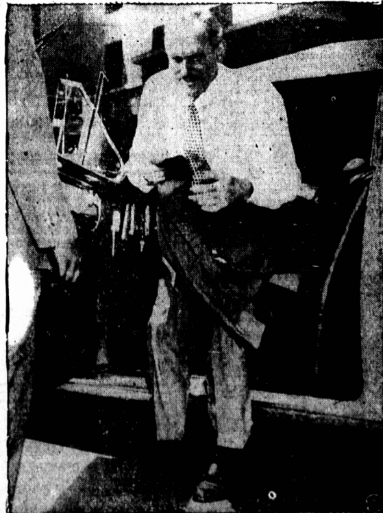
EMERGENCY TRIP —Secretary of State Dean Acheson arrives at the State Department in Washington to take charge of an emergency conference, called to examine the Korean crisis. Red North Korean forces invaded the U. S.-backed South Korean Republic and the international situation became even tenser.