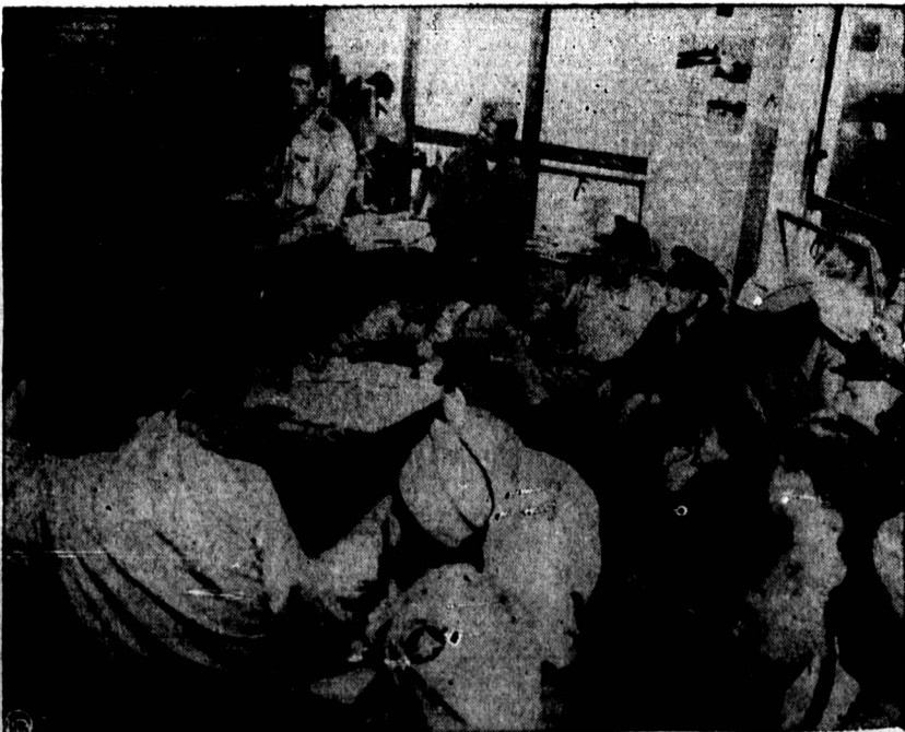
RESCUE BRIEFING —Pilots are briefed at General Mitchell Field, near Milwaukee, for an air search in connection with the Northwest DC-4 that crashed in Lake Michigan with 38 persons aboard. Plane was on a non-stop flight from New York to Minneapolis when it went down. Wreckage of the craft has been found in the waters of Lake Michigan.