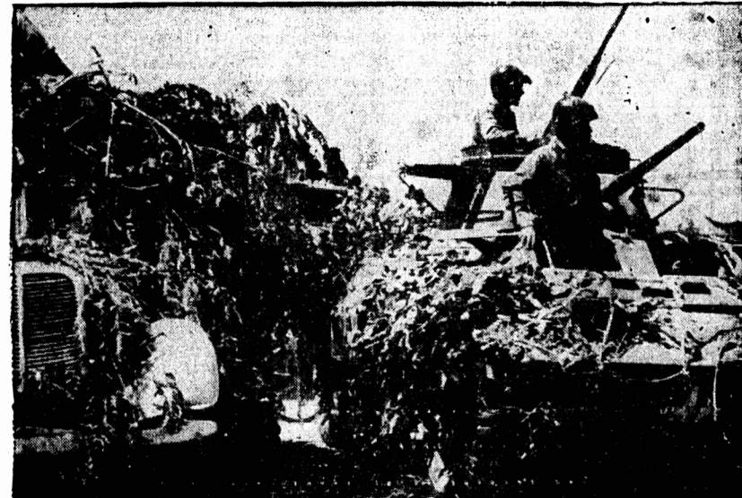
HEADED FOR FRONT — A Korean M-8 reconnaissance car furnishes anti-aircraft and small arms protection to South Korean troops moving up to the front where reinforcements will attempt to halt tank-led Red advances. Reports had U. S. mechanized equipment rushing north to meet an expected thrust at Taejon, Yank base. North Koreans continued south after taking Chonan, about 60 miles south of Seoul.