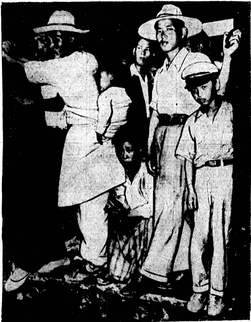
A tide of humanity continues to flow south across Korea before the armored spearheads of the Reds. These Korean civilian refugees fled carrying nothing but their children. All they ask is to be permitted to stay alive. They are shown packed into a boxcar in South Korea. U.S. Eighth Army has blown up bridges across Kum river, only a dozen miles north-west of Taejon, and poured artillery fire into the Korean divisions on the north bank.