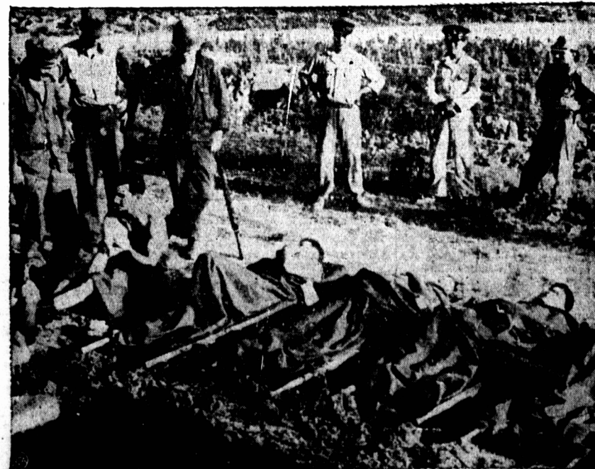
KOREAN CASUALTIES — American soldiers await evacuation to a hospital after being wounded in the Korean war. These are among the first U. S. casualties in the struggle against Red North Korean invaders of South Korea. Late communiques from Gen. MacArthur's headquarters were ominously silent about the report of an American "lost battalion" cut off by Red forces.