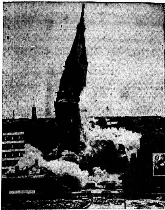
Historic Georgian Church, Berlin landmark, survived war and explosives of World War II, but this picture, just released, shows it had a few close calls. Church was damaged somewhat but tower escaped intact.