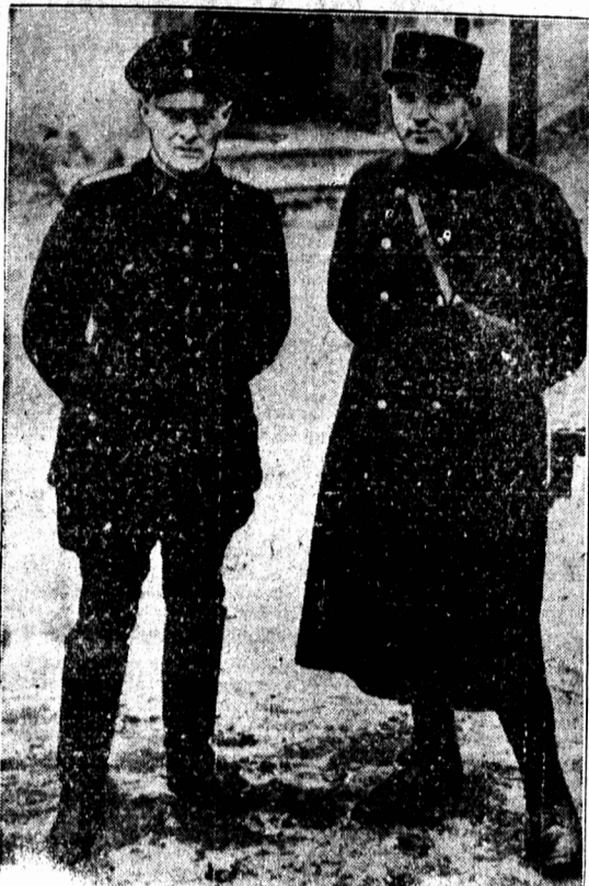
The frontier towns of Nassweiler and Rosbruck have a line dividing them. On each side of the line are parallel roads marking the respective domains of France and Germany. On the right is a French customs inspector and at the left a customs inspector of Germany, who appear personally friendly, despite the strained relations between their fatherlands due to Germany's reoccupation of the Rhine.