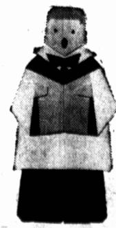
CHOIR BOYS cut out of 24"x48" pieces of Sylvaply. Easy to cut out, easy to paint, and Sylvaply withstands snow, rain, sleet — anything old men winter can create!