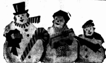
SNOWMAN AND FAMILY Make them in a few hours with a sheet of Sylvaply and free Sylvaply plan!

SEE "SEARCH FOR ADVENTURE" Thrilling TV action show, every week. Consult your paper for time and channel.