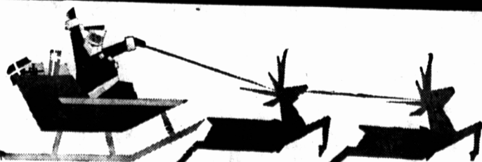
SANTA, SLEIGH, AND REINDEER for your front lawn or rooftop! Easy to cut out of a single sheet of 4' by 8' Sylvaply Plywood! Sets Up 15 Feet Long!

Get free Sylvaply plan folder at your lumber dealer's now!