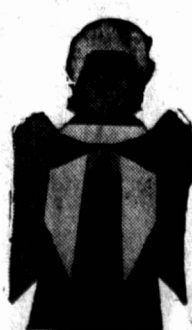
ANGELS are made with a few simple saw cuts, then nail the pieces together and paint. A 36"x48" piece of Sylvaply makes an outdoor Angel that will last for years.