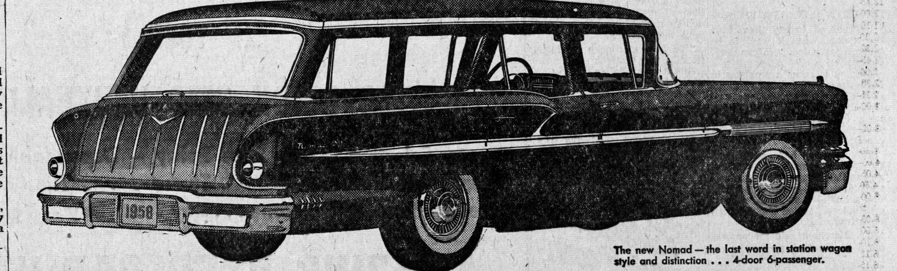
The new Nomad — the last word in station wagon style and distinction... 4-door 6-passenger.