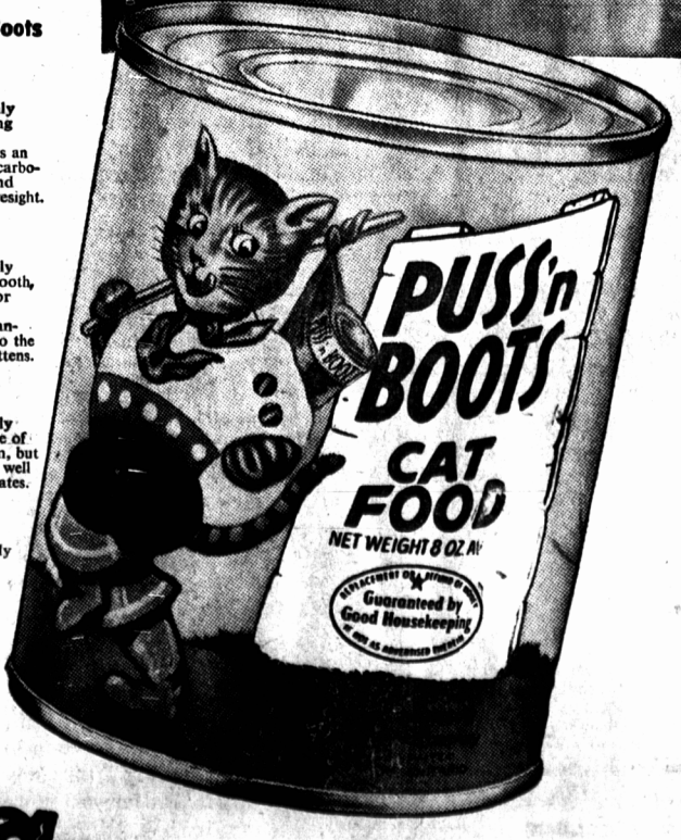
In the economical 15 oz. and convenient 8 oz. cans.