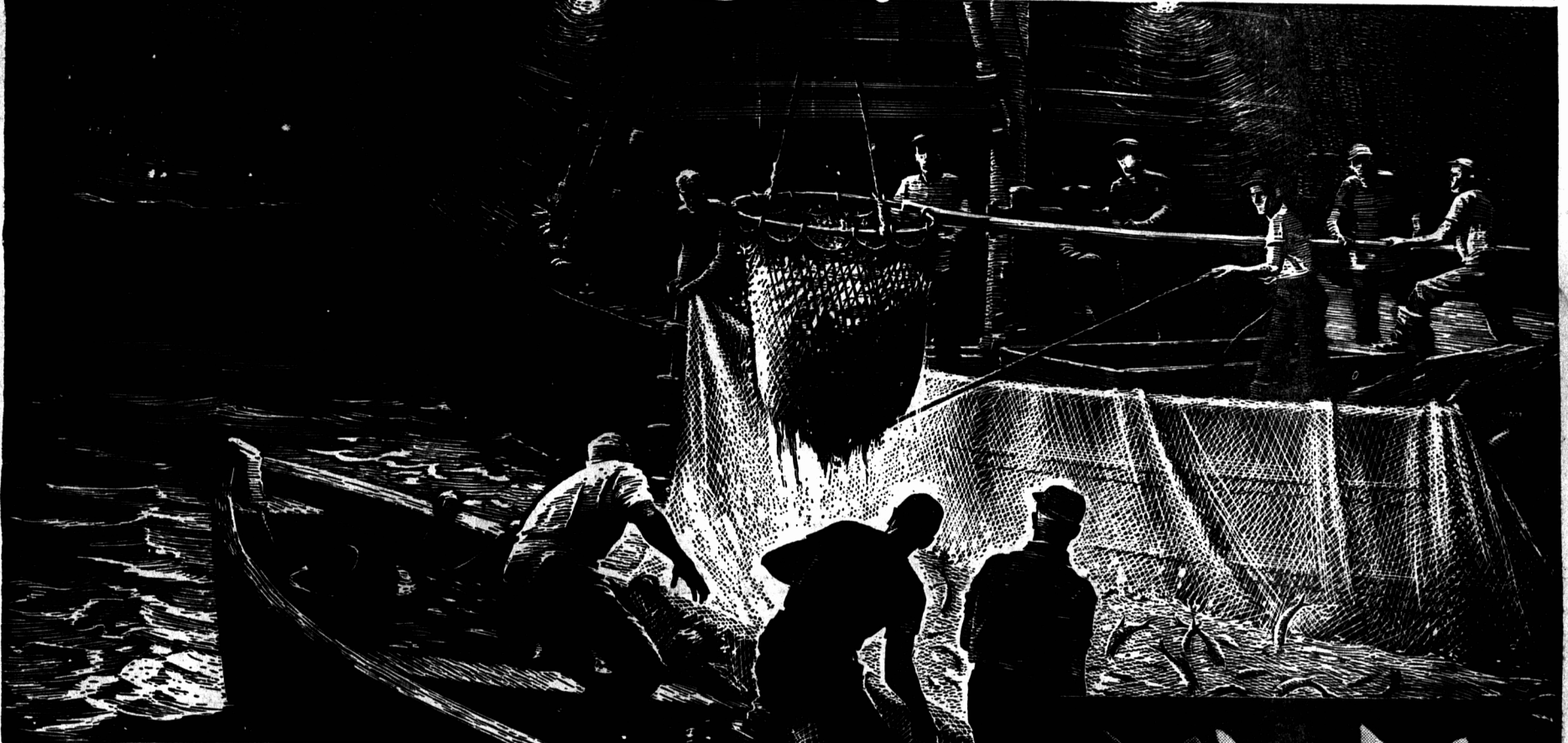
These fresh-caught fish are reeled from Canadian coastal waters into sanitary canneries, where the whole fish is processed into Puss'n Boots Cat Food.