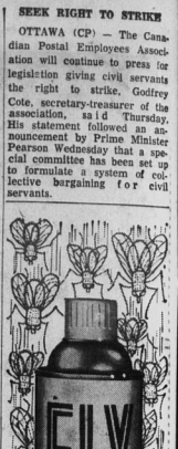
BLASTER Kala Flies, Mosquitoes GREEN CROSS PRODUCTS

IN LOVE WITH A CERTAIN NEW CAR? BUY IT NOW WITH A 50%-GOOD, LIFE-INSURED LOAN THE BANK OF NOVA SCOTIA death to flies with push-button ease... from Green Cross