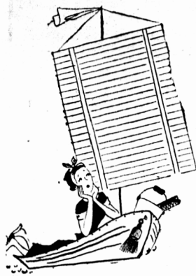
There's no cleaning problem in sight when you get