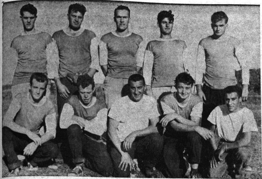
SOUTHERN KINGS CHAMPS