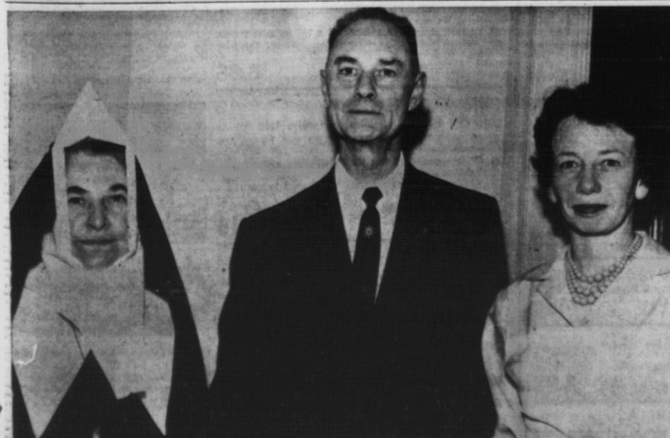
TEACHERS HEAR GUEST SPEAKER FROM N.S.

SNOW HALTS FOREST FIRES HALIFAX (CP) — A touch of winter early Wednesday ended Nova Scotia's first outbreak of spring forest fires. Temperatures near freezing, heavy frost—and even some snow—helped firefighters in the southwestern counties of Yarmouth and Shelburne extinguish half a dozen brush fires. Two of the fires had caused concern Tuesday night. One near Shelburne, 150 miles south of here, burned to within 500 yards of the tiny village of Roseway. It skipped over nearly 300 acres of scrub and brush before the combination of weather and efforts of 200 men put it out. Another major fire in Yarmouth County was checked earlier when three inches of snow fell overnight. No property losses were reported in any of the fires. Meanwhile, police were searching for a firebug spotted in Shelburne County Tuesday by a fire patrol plane. The man was seen attempting to start a brush fire