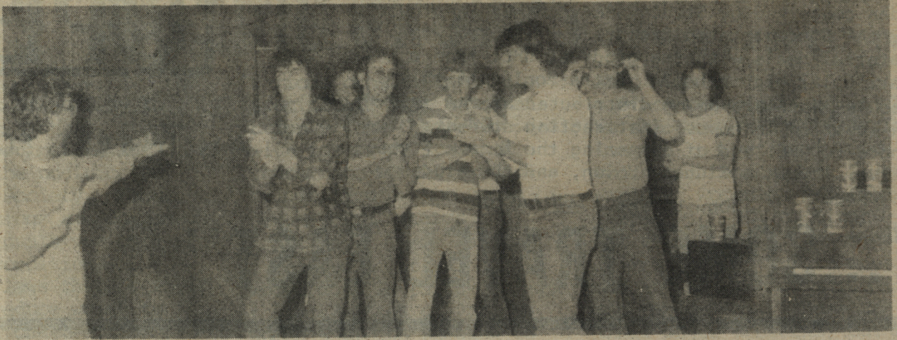
Fun and games in the Marian Hall Lounge

Marian Hall is much the same as Bernardine. It has 26 semi-private rooms and 7 private rooms. The kitchen, T.V. lounge, study room and laundry facilities are all located on the main floor; each floor has a lounge and study room. Dining facilities for both Marian and Bernardine Hall are located in the Main Dining Hall, less than 5 minutes walking distance from either residence.