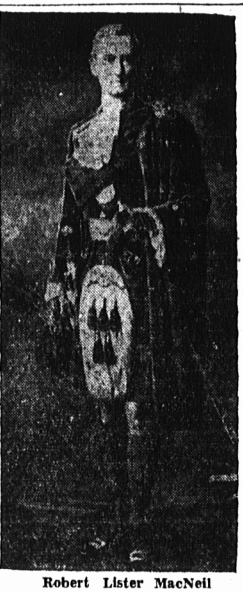
Robert Lister MacNeil