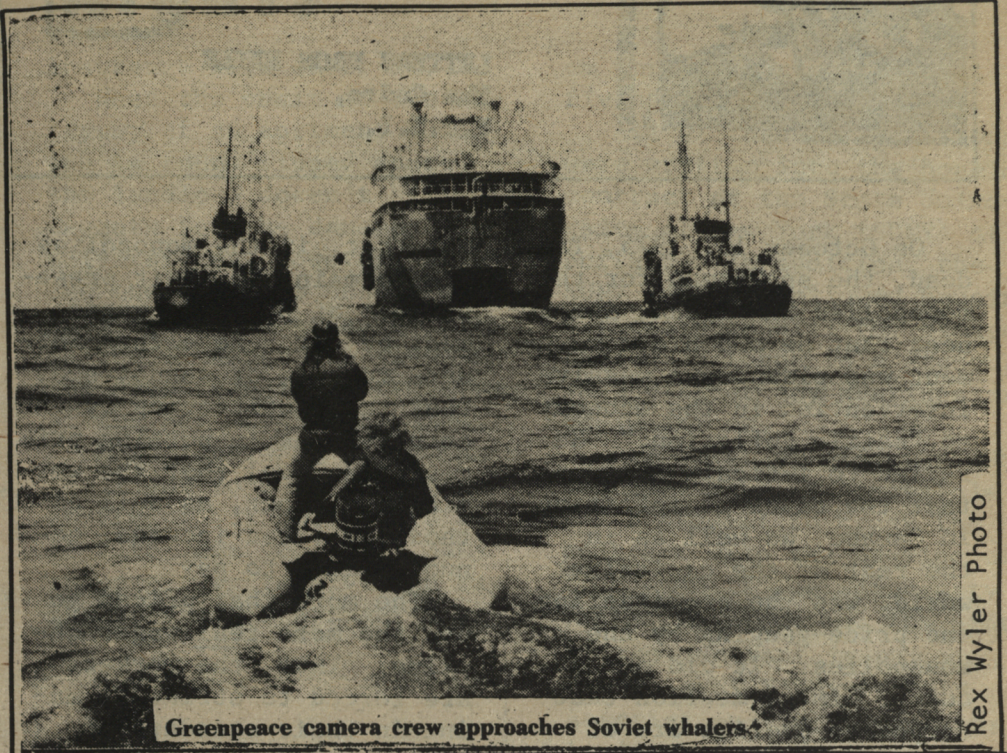
Greenpeace camera crew approaches Soviet whalers