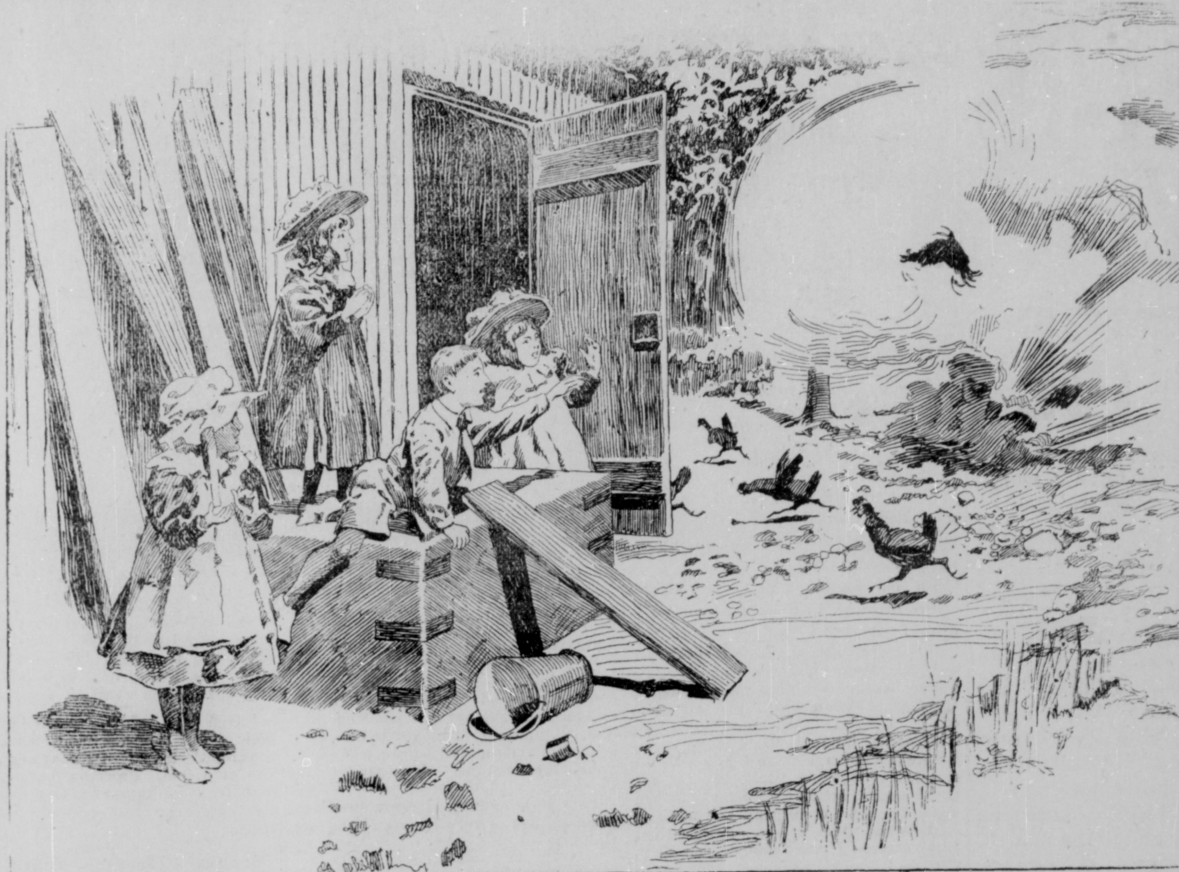
SHELL FALLING IN LADYSMITH DURING THE SEIGE.