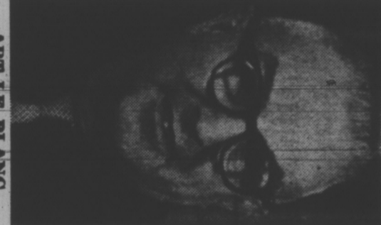
ART LE BLANO