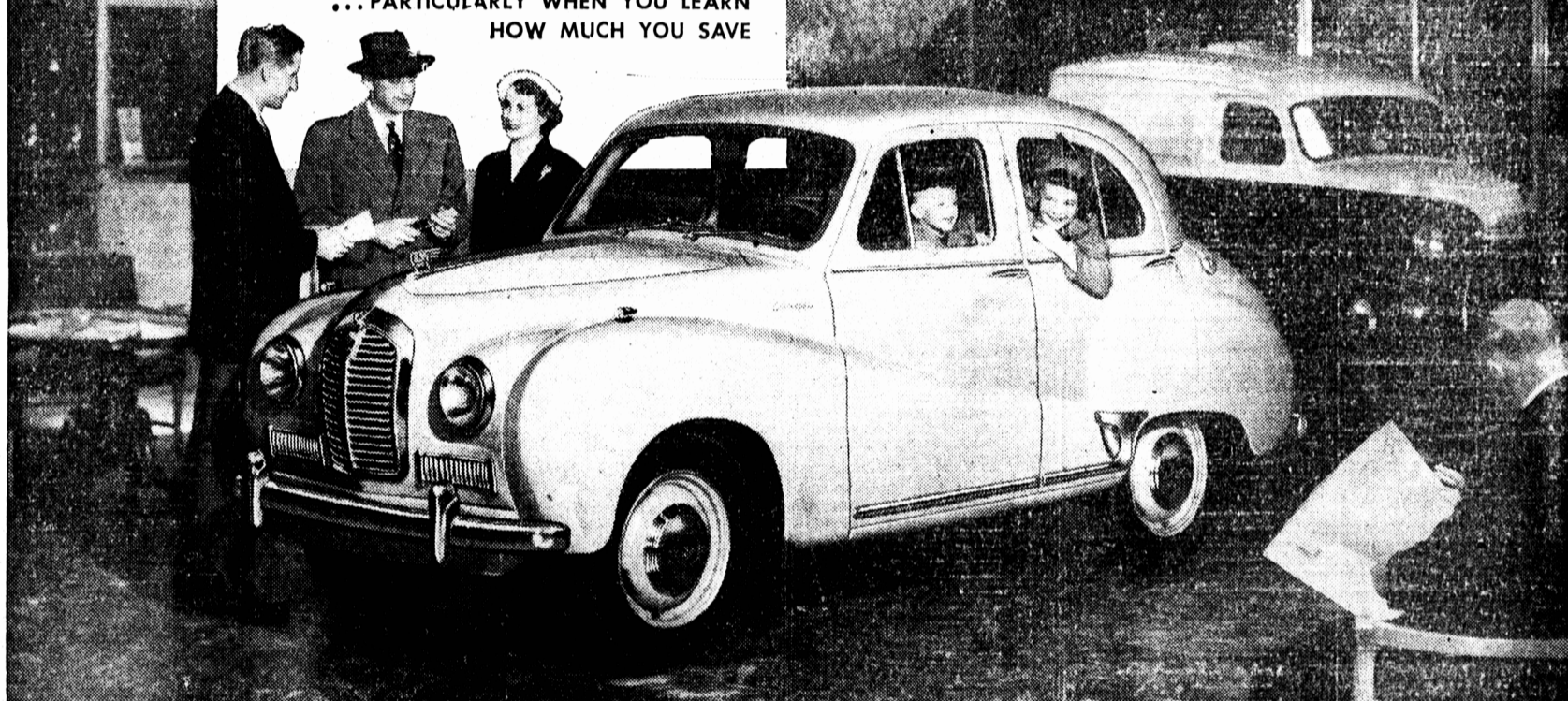
The famous AUSTIN A-40 Somerset 4-Door Sedan. NO EXTRAS TO BUY - $1895* A COMPLETE CAR AT

It'll be love at first sight ... PARTICULARLY WHEN YOU LEARN HOW MUCH YOU SAVE