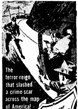
The terror-reign that slashed a crime-scar across the map of America!