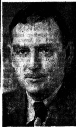
Lt. Col. J. D. Stewart, Mayor of Charlottetown

Charlottetown is situated on one of the finest harbours in Canada capable of receiving ships of heavy burden into a sheltered basin formed by the junction of the north and west rivers with Hillsboro River.