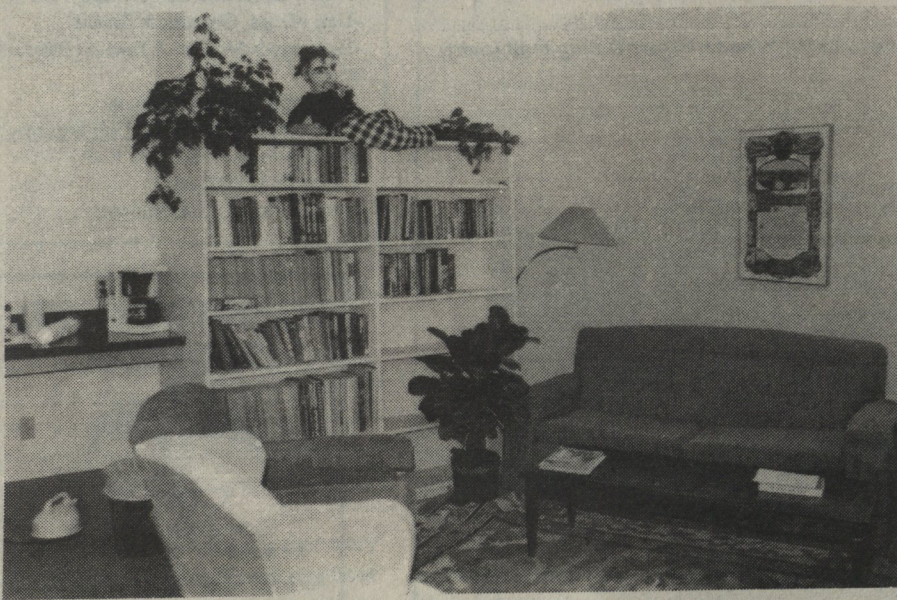
The English and Fine Arts lounge is the first lounge we came across without a microwave, but does supply you with a friend 24 hours a day.