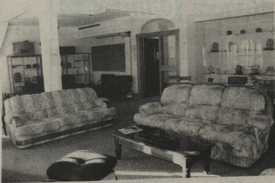
Despite the dead heads, we really liked the Sociology, Anthropology and Religious Studies lounge. Kathy says the furniture is "just like home, and they even supply you with a clean table cloth!"