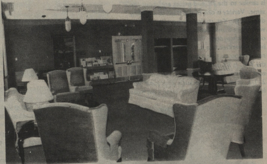
We weren't even sure we were allowed to enter the faculty lounge, let alone sit on the furniture. This place is truly swank, it even has a piano and a dishwasher.