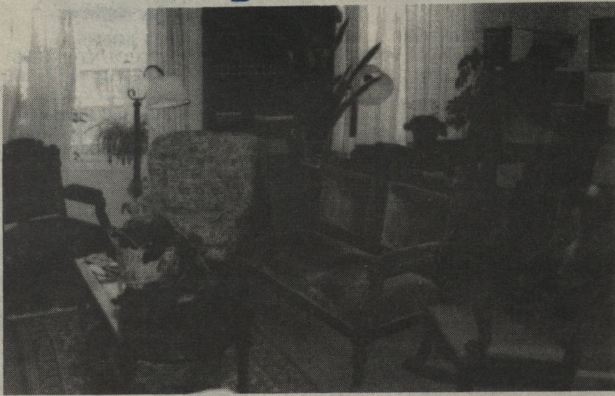
The History, Classics and Canadian Studies lounge shows that if you want style, ask the profs to donate antique furniture— but what the hell is that machine in the corner?

ALL LOUNGES ARE NOT CREATED EQUAL. With this in mind we'd like to take you on a tour of the department lounges. This week we tour Main Building.