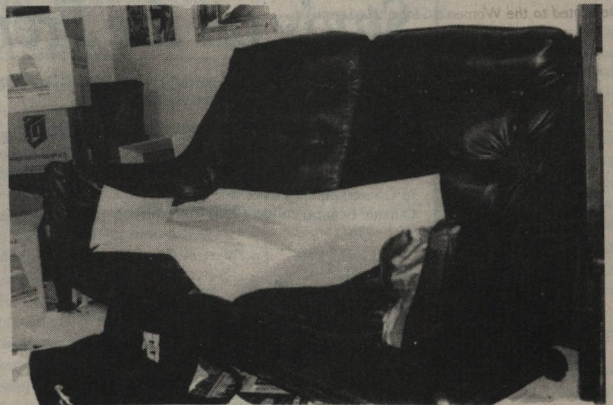
This is all that remains of the now defunct Philosophy lounge and is hidden in the bowels of the X-Press office.