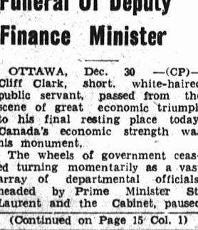
(Continued on Page 15 Col. 1)

The wheels of government ceased turning momentarily as a vast array of departmental officials, headed by Prime Minister St. Laurent and the Cabinet, paused