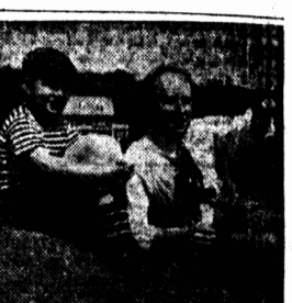
been "too scared to mention them for fear of ridicule."

At dusk old Hughey disappeared, after borrowing another quarter. But the next day, early, he was there again and Hickey growled when he saw him. "Mason had ought to run that old bum off," he grumbled. "He's bad luck." But old Hughey only sat quietly under a tree, taking out his plug tobacco now and then to whittle on it. Gary, feeling vaguely sorry for the old man, begged a couple of slices of bread and a chicken leg from Maris for Hughey. Hughey accepted them with lofty grace, with an air that said that he had been wondering why largess was so slow in forthcoming. But Gary did not linger.