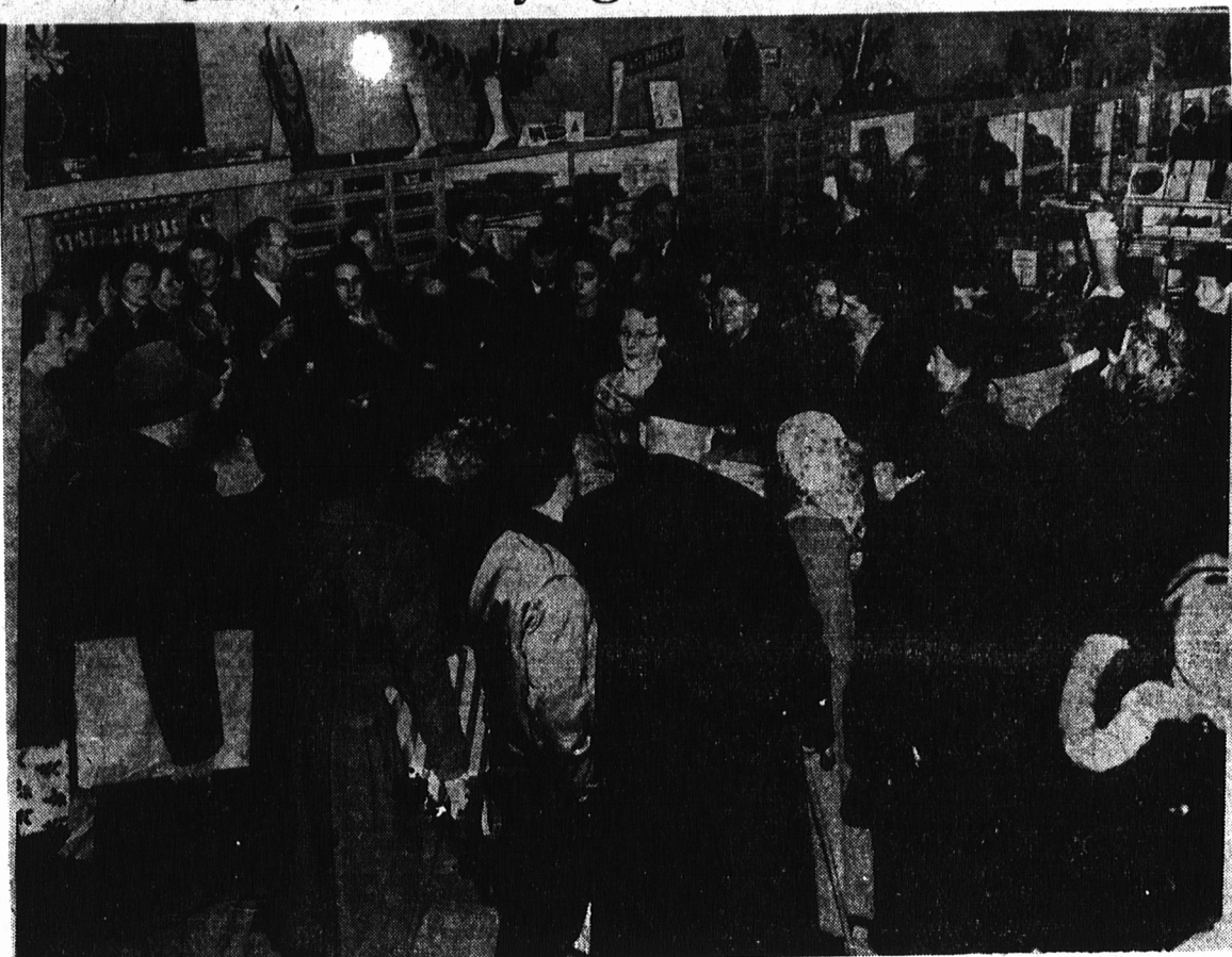
A recent despatch from New York stating that this city had exceptionally high buying power is amply borne out by the above picture showing part of the huge crowd which Saturday literally invaded the store of Moore and McLeod Limited. Despite the tremendous pressure created by so many people there was a gay and cheerful atmosphere prevailing; courteous clerks waited on the gift-laden customers and made their task easier as the tail-end of the Yuletide shopping season approached.

CENTRAL GUARDIAN This column is reserved for news of local interest, but advertising of a new way nature may be inserted at five cents a word, strictly payable in advance.