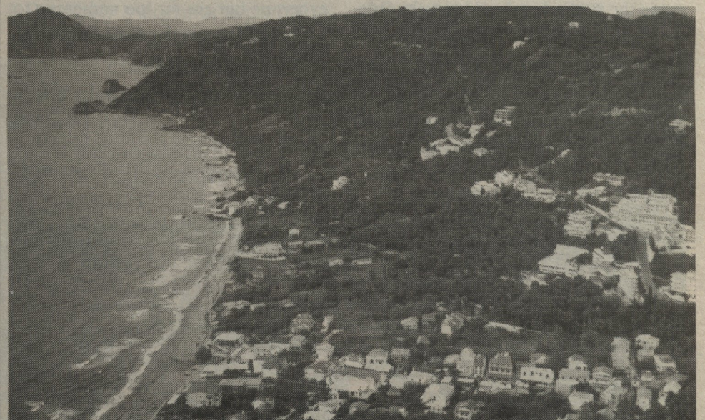
The Pink Palace on Corfu - nestled into the side of paradise