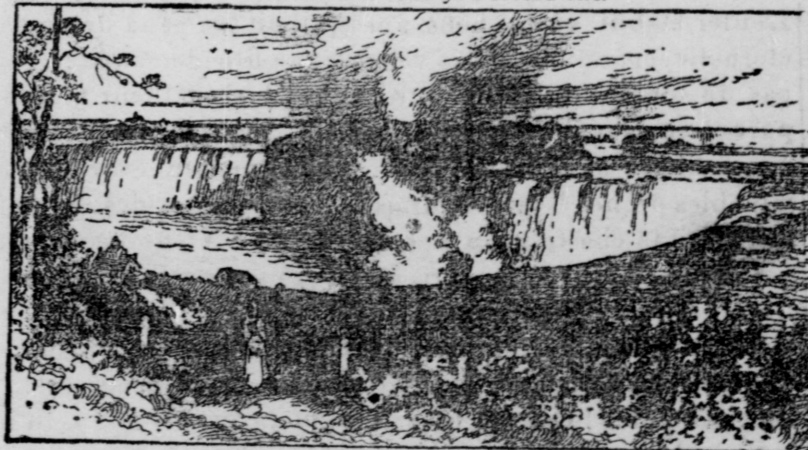
This cut illustrates but very faintly the magnificence of the original.

There are only a few copies of this magnificent art work left and you will be fortunate indeed if you secure one.