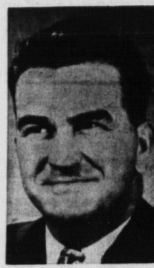
Hon. J. Angus MacLean