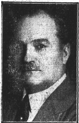
HON. C. A. DUNNING Minister of Finance