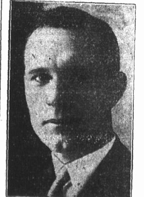
HON. A. L. MACDONALD Premier of Nova Scotia