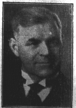
HON. A. A. DYSART Premier of New Brunswick