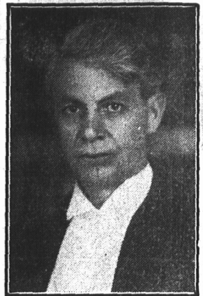
MR. JUSTICE A. E. ARSENAULT Convenor of the Confederation Celebration Committee.