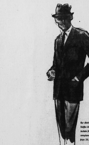
Our distinctive Shiffer-Hillman Sports Jackets from $59.50, complementary slacks from 25.50