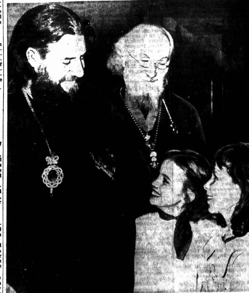
RUSSIAN PRELATES GET SMILES