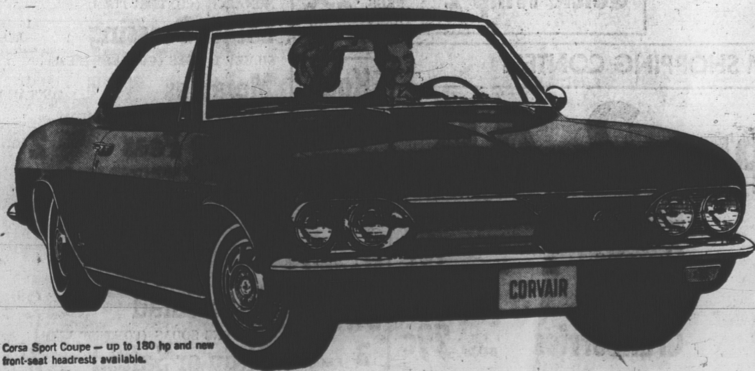
Corsa Sport Coupe — up to 180 hp and new front-seat headrests available.