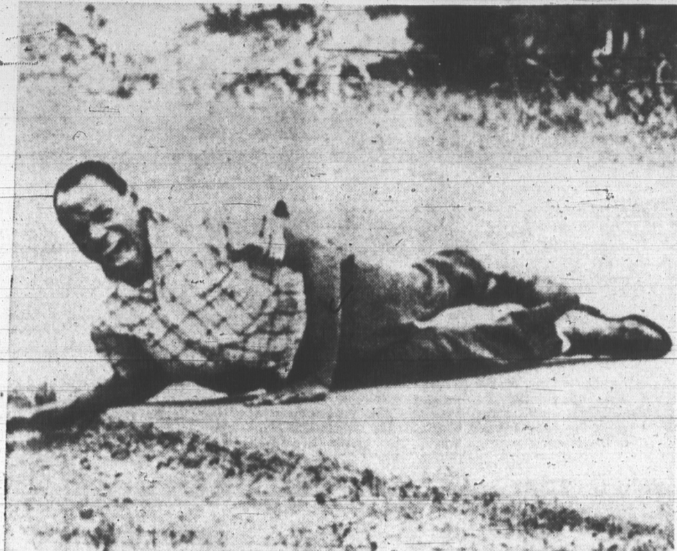
NEGRO JAMES Meredith himself across Highway 51 at march to Jackson, Miss. Monday afternoon.