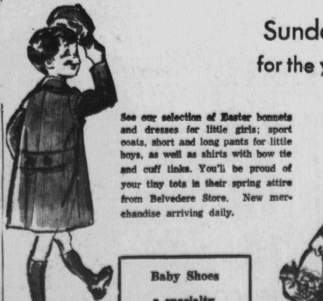
Baby Shoes a specialty

For Mother . . . Smart shoes for the lady of the house in the latest patterns, best heights and colors by famous names as Vitality, Naturalizer, Fiancee, Savage, Sapphires.