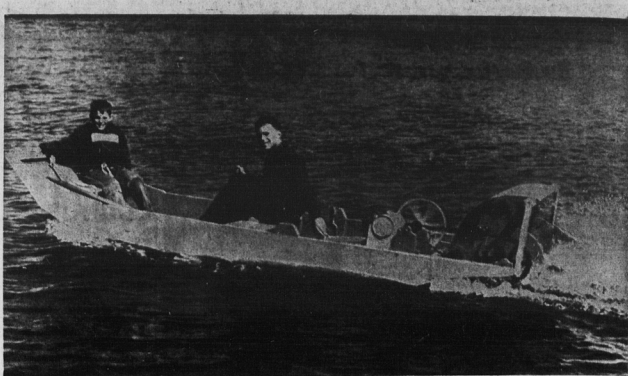
MONTAGUE SCOUTS LAUNCH STERN-WHEELER

Dealers at Alberton wharf are besieged with requests for mackerel to be peddled from door to door as there is a heavy demand for the first mackerel of the season. High winds prevented lobster fishermen from overhauling most of their gear yesterday and all boats were back in Port before noon. Lobster landings continue very poor.